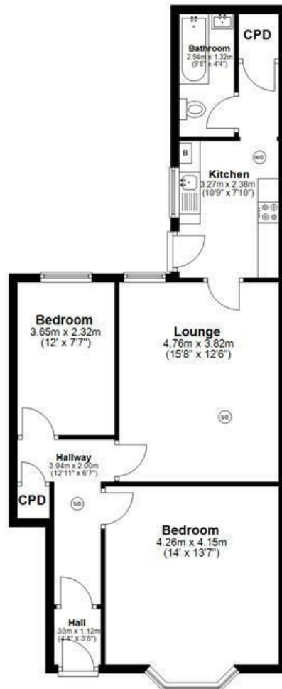
Total area: approx. 69.4 sq. metres (747.4 sq. feet)

This floorplan is for illustrative purposes only and is not drawn to scale. Measurements of benches, stairways, openings etc are approximate. They should not be relied upon for any purpose and do not form part of any agreement. No liability is taken for any error or mis-statement. Plan produced using PlanUp.